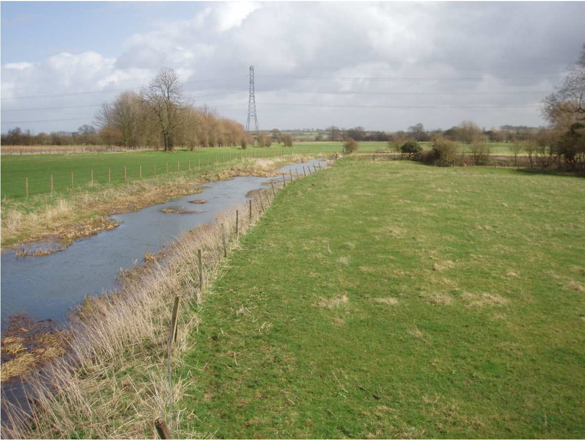
Great Ouse valley looking east showing floodplains adjacent to the meandering river.