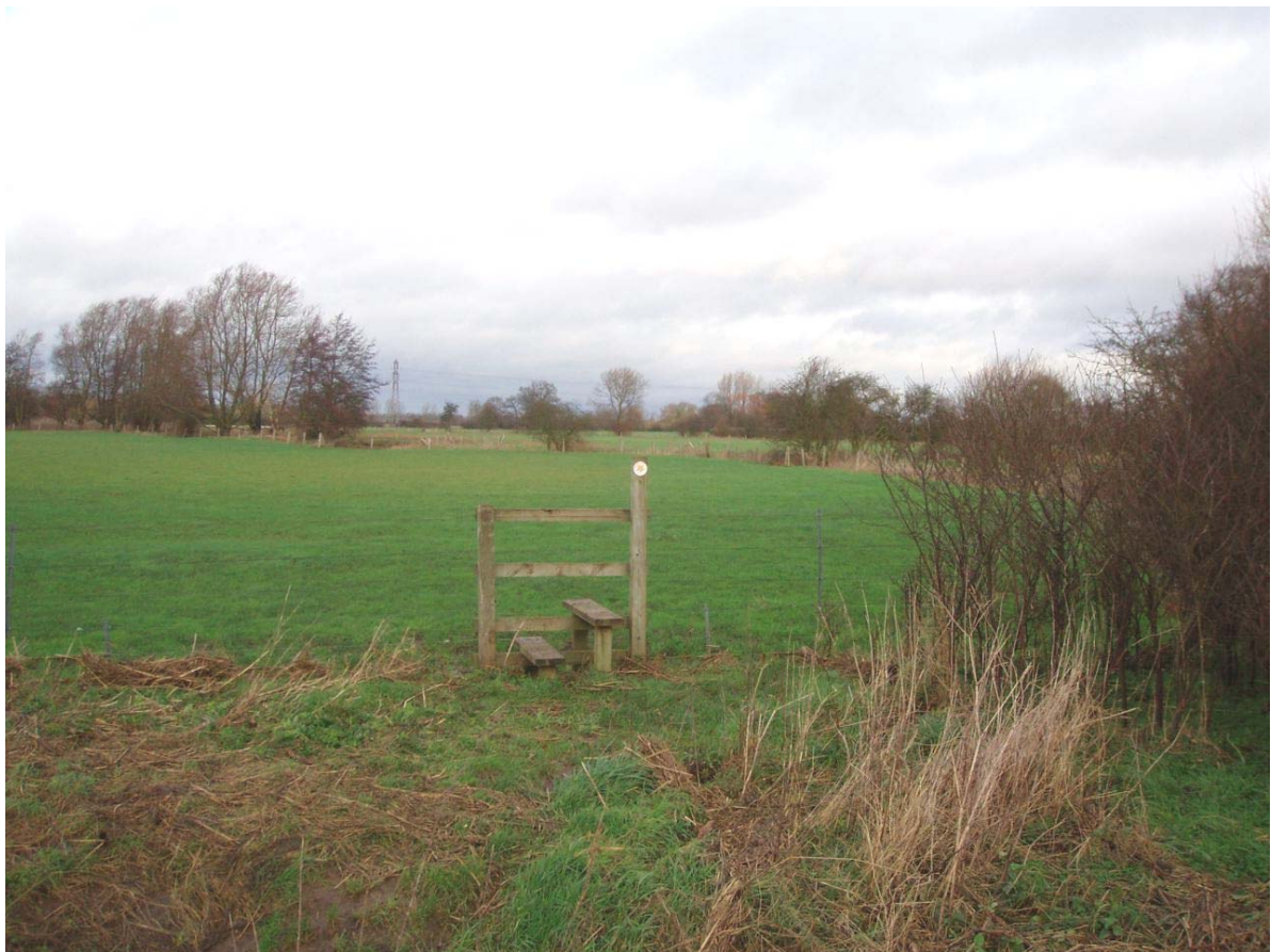
Twyford Vale looking north from Kingsbrigde over the course of the Padbury Brook.